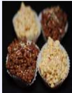
Rice crispy cakes