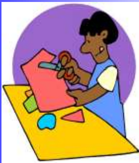
Arts and crafts