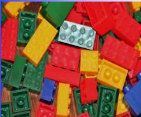
Construction Toys inc. Lego, Knex, Duplo, Brio, Klikko, Kids Knex.