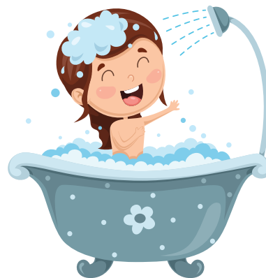
Having a bath