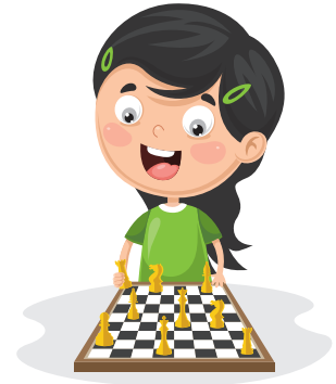
Playing a game with friends