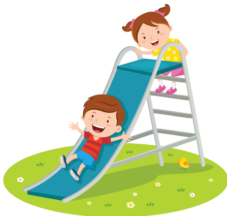
Playing with friends on the school playground